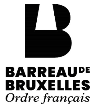
Ordre français des avocats du barreau de Bruxelles