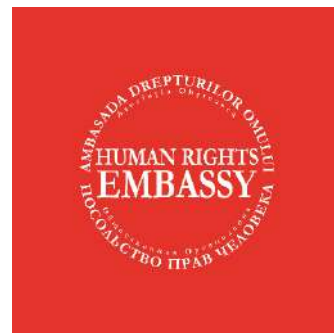
Human Rights Embassy