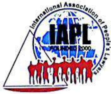
International Association of People's Lawyers (IAPL)