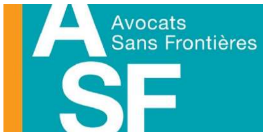
Avocats sans Frontières (Belgique)