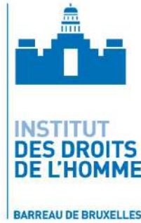
Institut des droits de l'homme du barreau de Bruxelles