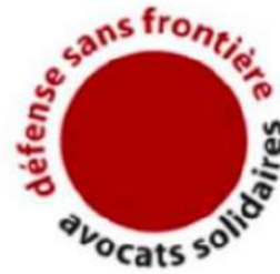
Avocats solidaires – Défense sans frontières