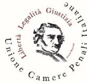
Unione delle Camere Penali Italiane Union of the Italian Criminal Chambers