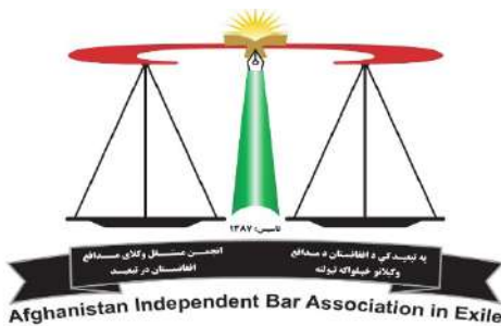
Afghanistan Independent Bar Association In Exile (AIBAIE)